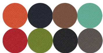
ApPeel® Ortisei YT

All Formats Available in 3 Sizes & 3 Cover Materials